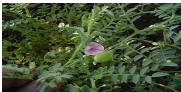
Fig. 1. Cicer arietinum L. plant

The following materials were used for the experiments: cambic chernozem soil with the characteristics presented in table 1, Cicer arietinum L. seeds of Cicero 1 variety developed at I.C.C.P.T Fundulea (Fig. 1), with the chemical composition presented in table 2.